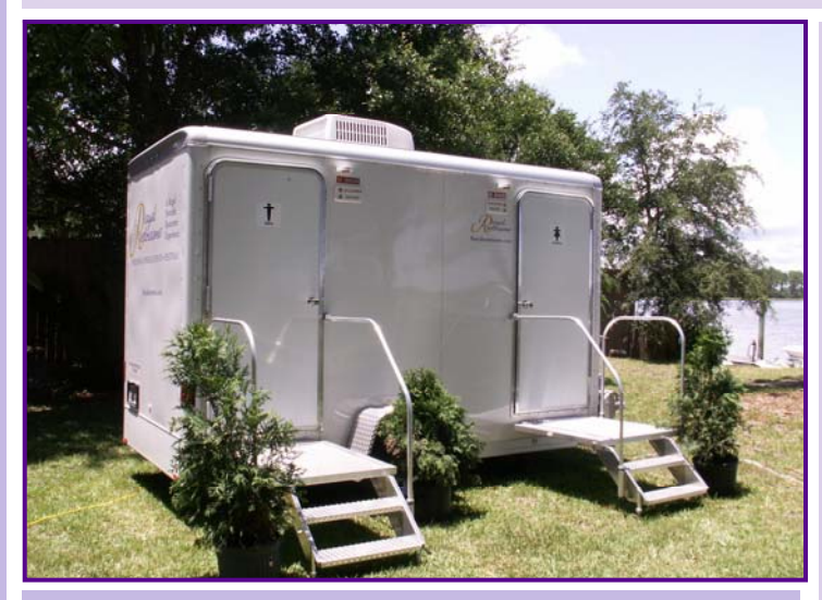
Weddings • Special Events • Festivals Fundraisers • Business/Residential Remodels Film/Music Production