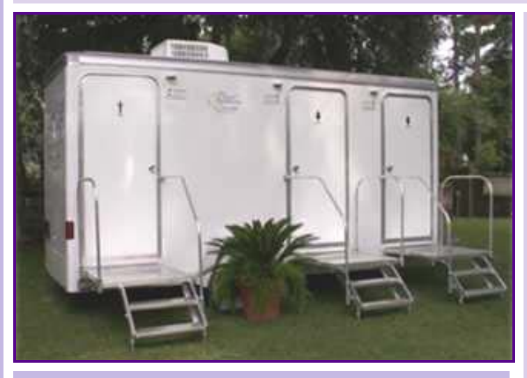
Weddings • Special Events • Festivals Fundraisers • Business/Residential Remodels Film/Music Production